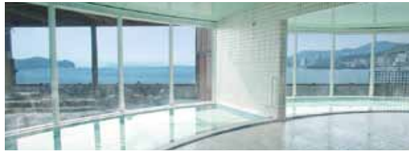
Public Bath Olive

Fading sunlight and ever-changing scenery on the sea, and sound of sea breeze... Embraced in the steam and relaxing water You will find your own sanctuary.