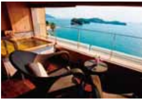
Deluxe Suite with Open-air bath Room 604, 605 (Up to 5 persons)

From the moment you arrive, the time poses. Indulge in the ever-changing scenery. Open the page of your special resort experience.