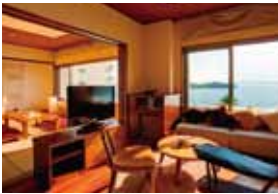
Deluxe Suite Room 601 (Up to 7 persons)