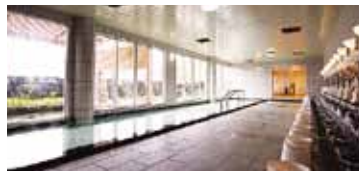
Public Bath Hamakaze