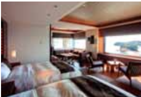
Suite Room 811 (Up to 6 persons)