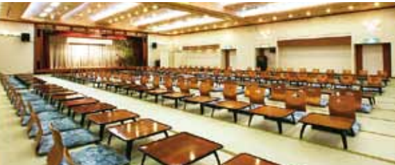
1F Banquet Hall "Olive" (467㎡•dividable to 3 rooms)

Delightful time awaits you with the elegant cuisine prepared by our chefs and heartfelt service and hospitality. Share intimate moments with family and friends.