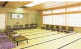
2F Middle and small size Banquet halls (5 rooms)