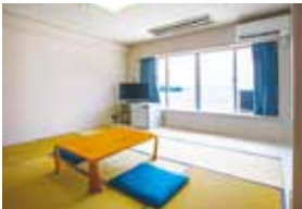
Japanese Style Room (Up to 5 persons)