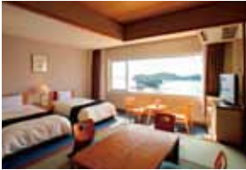
Japanese-Western Style Room 2 beds + Tatami room (Up to 5 persons)