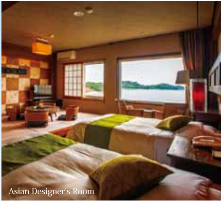
Asian Designer's Room