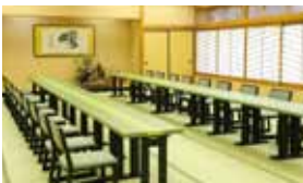
Table and chair seating is also available (Make a inquiry)