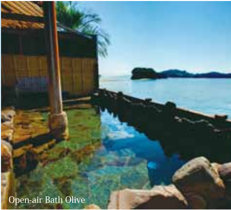
Open-air Bath Olive

Enjoy the supreme time in the open-air bath by the beach