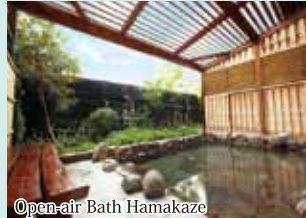
Open-air Bath Hamakaze

Indulge in relaxing natural hot spring "Olive" and "Hamakaze". About our hot spring <Hot spring type> Alkaline hot spring <Efficacy> fatigue, stress, poor blood circulation, neuralgia, muscular pain, arthritis, frozen shoulder, motor paralysis, chronic digestive diseases, hemorrhoids etc. *Natural hot spring water is used only for the open-air bath.