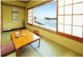
Japanese Style Room (Up to 5 persons)